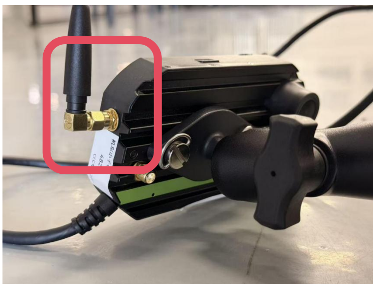
图 2.6: 4G 天线的安装

Screw the 4G small antenna (P3) onto the threaded port on the side of the main unit, as shown below.