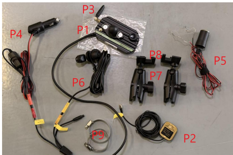
图 1.1: 零件组成