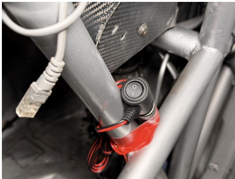
图 2.2: 电源线插入点烟器座、开关打开

Insert the power cable (P4) into the cigarette lighter extension cable (P5), and set the switch on the power cable to the ON position.