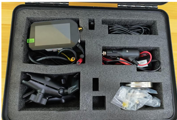
图 4: 收纳

结束之后，车队应负责将上述设备清点，收纳，如下图方式收纳到包装箱内交还 After the event, the team must inventory all equipment listed above and store it in the storage case as shown in the diagram below before returning.