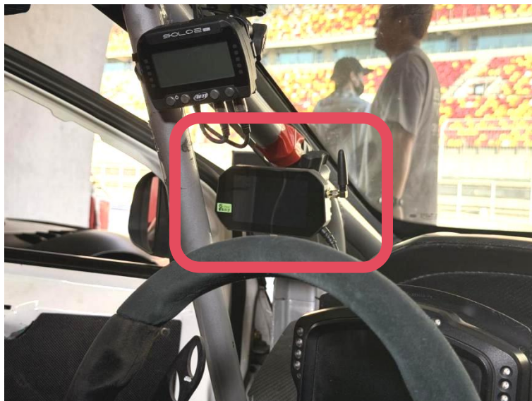
图 2.4：建议的安装位置 Recommended Mounting Position (Original figure reference)

Mount the assembled main unit on the roll cage at the position shown below.