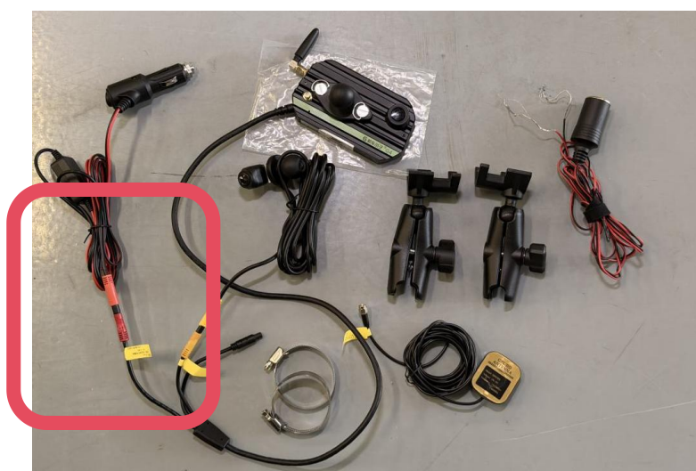
图 2.5：电源线插入主机 Power Cable Connected to Main Unit (Original figure reference)

Insert the red connector of the power cable (P4) into the red port of the main unit. The device will automatically power on.